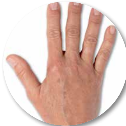
Back of Hand following treatment

Your doctor would be pleased to talk to you about aesthetic procedures to help rejuvenate the appearance of your hands.