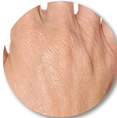
Back of Hand following treatment