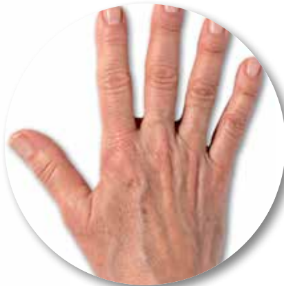
Untreated back of Hand