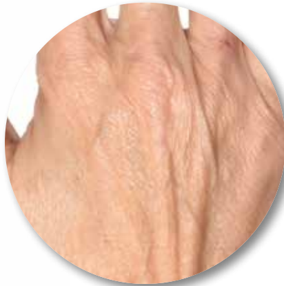
Untreated back of Hand